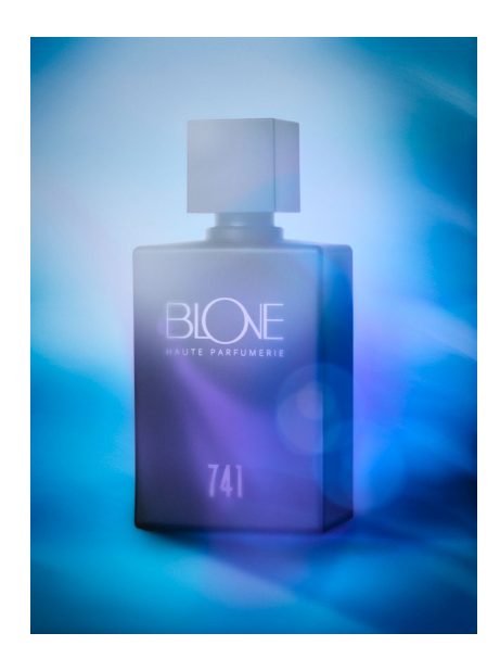
741 Eau de parfum - 75 ml

An explosion of flowers and fruit, the olfactive resonance of love. At first, a thousand bursts of citrus unfold. Then, at the heart of the bouquet, jasmine and rose mingle with peaches and mirabelle plums, before softening into a delicate final trail of white musk and vanilla.