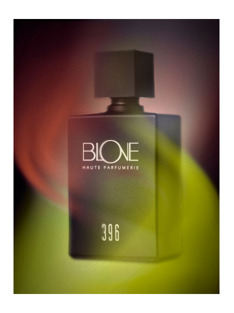
396 Eau de parfum - 75 ml

Follow us on: Instagram: blonehauteparfumerie Website: blonelamaison.com