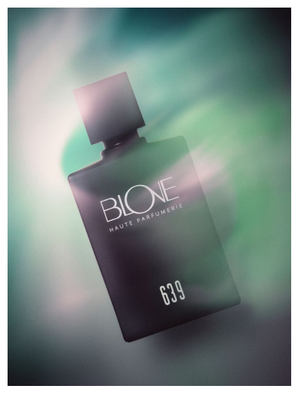
639 Eau de parfum - 75 ml

First, the energy of grapefruit and lemon, enhanced by a spicy touch of pepper and coriander, shines through. Then tonka bean and incense ignite, before giving way to a sensual woody vertigo of vetiver and sandalwood.